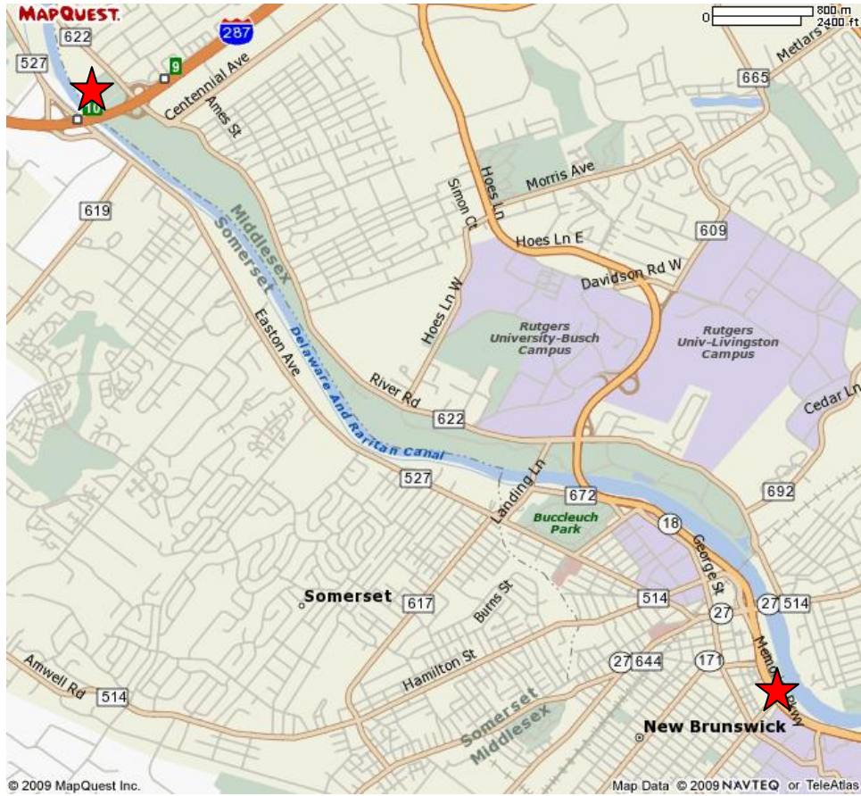
Map showing starting point in Piscataway to ending point in New Brunswick.